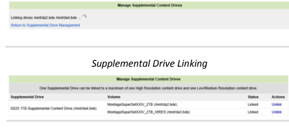
Supplemental Drive Link Complete