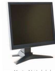
Monitor Not Included