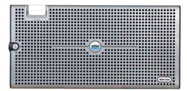
Front Bezel Faceplate